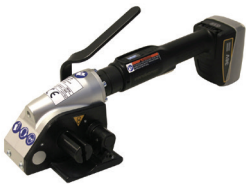
Battery Tensioner CBT40 (AAR)

USE THE RECOMMENDED TOOLS TO ENABLE EASY, FAST AND CONSISTENT APPLICATION.