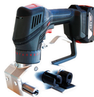
Battery Tensioner CBT35 (Non-AAR)