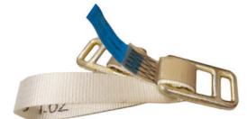
Retainer Buckle (Compressible Bulk Loads)

USE THE RECOMMENDED TOOLS TO ENABLE EASY, FAST AND CONSISTENT APPLICATION.