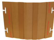
FlexBoards (drums and big bags)