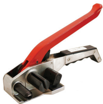
Manual Tensioner CT40 (2)