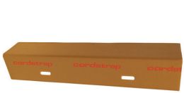
EdgeBoards (Soft Packaging)

ELASTIC WOVEN LASHING FOR FLEXIBLE RETAINING.