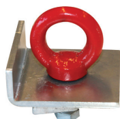
Reefer Lashing Point