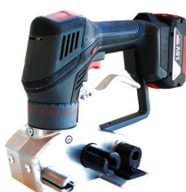
Battery Tensioner CBT35