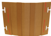
FlexBoards (drums and big bags)