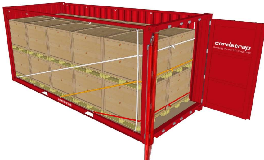
Cordstrap AnchorLash® 150.3 solution in a 20ft CTU