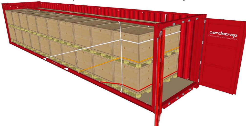
Cordstrap AnchorLash® 150.3 solution in a 40ft CTU